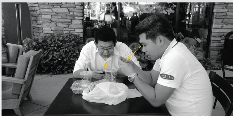
Digital devices are held at a different distance and angle than reading material.