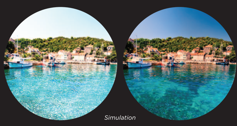
Ordinary clear lenses

Because Transitions Vantage lenses adapt to changing outdoor light by both darkening and polarizing, patients can now enjoy the benefits of polarization — during more hours of the day.